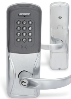
Version 5.2 supports Mercury Security-powered Allegion Schlage AD-300 networked wired locks.